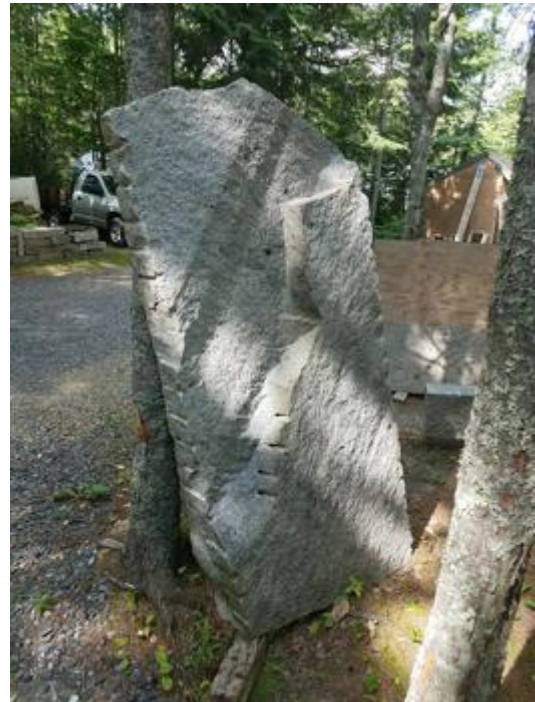
This is the back side of the stone

This is the stone that will be the Finnish historical marker.